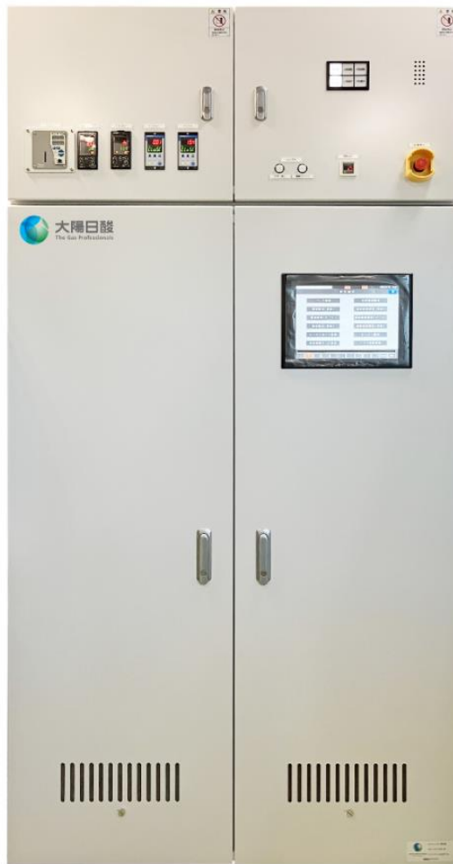
Figure 1. High-purity hydrazine delivery system (exterior)